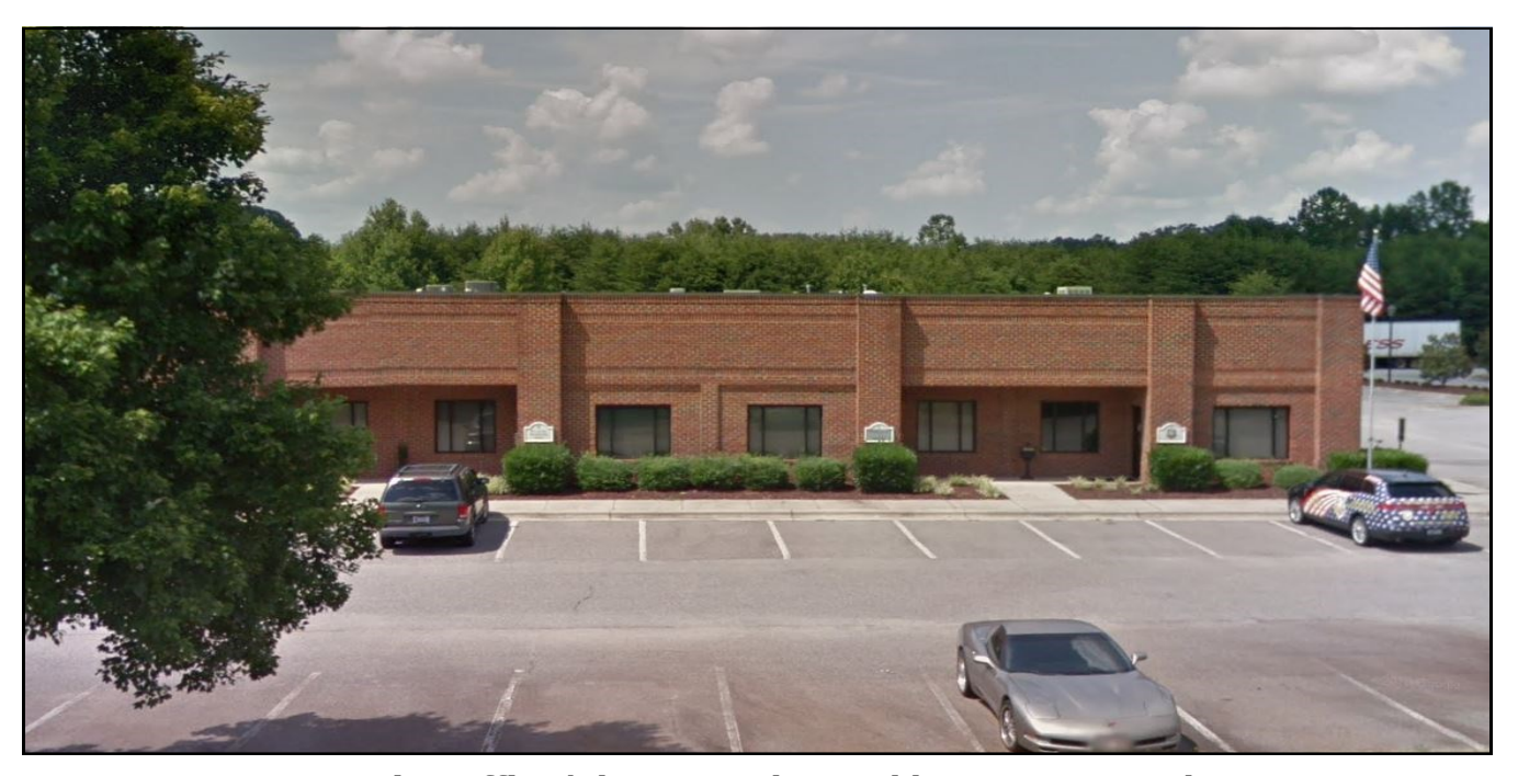
Very nice Office/Flex space located between 40 and I-40 Office has 1800 +/- square feet $1950 per month